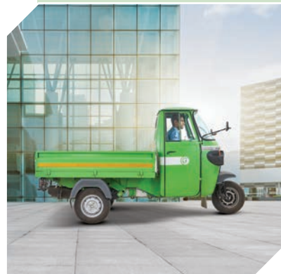
Highest ground clearance

Less impact from bad roads: highest ground clearance of 220 mm.