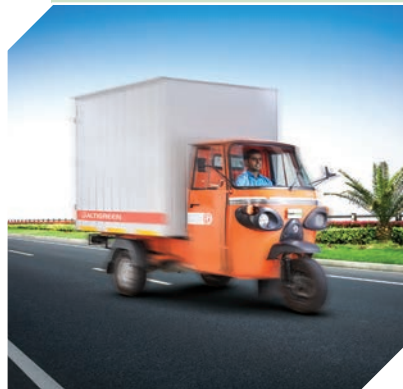
Best speed; greatest torque

Highest speed of 55 kmph. Highest torque at wheel of 810 Nm.