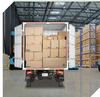
Largest volumetric capacity

20% more space for cargo with class-leading 177 cu. ft. container.