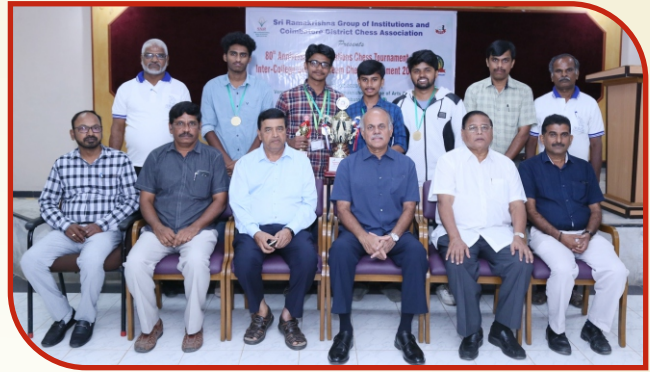
CDCA 80th Anniversary Inter College Chess Tournament 2020