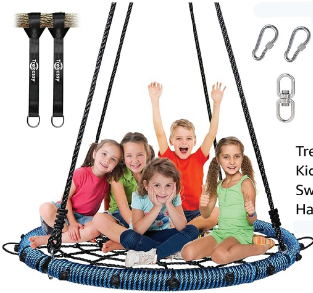
Trekassy 45" 750lbs Spider Web Tree Swing for Kids & Adults, Outdoor Steel Frame Saucer Net Swing with Swivel, Adjustable Ropes + 2 Tree Hanging Straps - Blue (Patented)