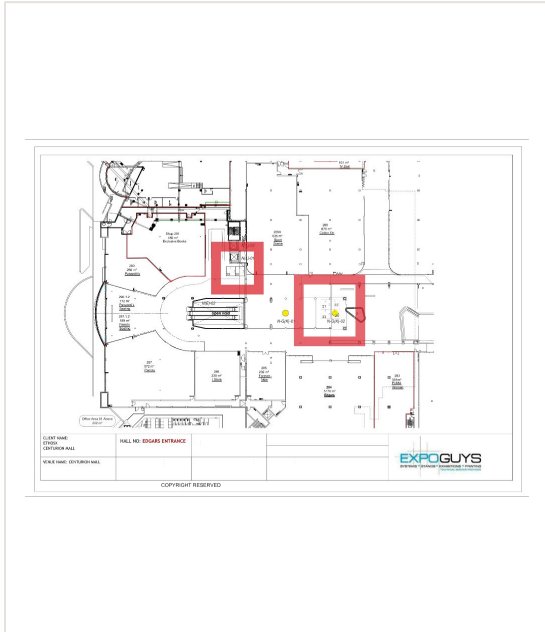
01 Edgars Entrance STANDS 19–24

Three premium activation clusters span the mall's busiest entrances — Edgars, Woolworths and Dis-Chem — placing your brand directly in the path of every visitor.