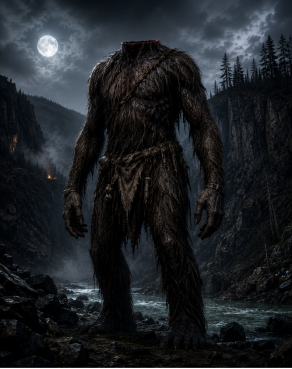
The Nuk Luk

Today, Nahanni National Park Reserve is celebrated as one of Canada's greatest natural treasures and a UNESCO World Heritage Site. Thousands of visitors explore its spectacular rivers and mountains each year without incident. Even so, many guides admit there are places where the silence feels unusually heavy, and where the wilderness seems to watch those who enter.