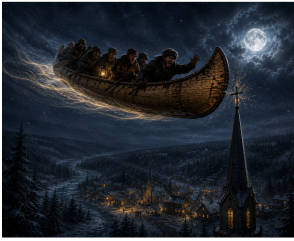
The Flying Canoe

As midnight drew near, they climbed back into the enchanted canoe and flew into the darkness. A sudden storm tossed them through the sky, church steeples loomed below, and panic spread among the crew. Some versions of the tale say they narrowly escaped by reaching camp just before the final stroke of midnight. Others warn that those who broke the Devil's bargain were never seen again.