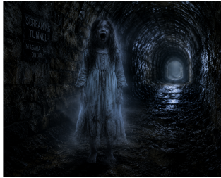
The Ghost Girl of the Screaming Tunnel

to the legend, the flame may suddenly go out on its own, and in the silence that follows, the distant cry of the young girl can sometimes be heard. Whether caused by drafts, imagination, or something beyond explanation, the ritual has become part of Niagara's enduring folklore.