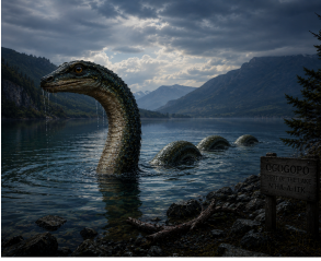
Ogoopogo, the Syilx (Okanagan) First Nations' honored N'ha-a-itk

In the early twentieth century, newspapers began reporting sightings of a long, dark creature moving across the lake. Witnesses described a serpent-like body with several humps rising above the water, gliding silently without creating much of a wake. Others claimed to see a horse-like head or a long tail disappearing beneath the surface.