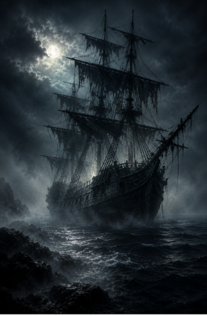
The Ghost Ship of the Northumberland Strait

Alarmed fishermen and coastal residents have launched boats to rescue the crew, only to watch the burning ship suddenly vanish before they arrive. No wreckage is ever found. The sea simply grows quiet once again, as though nothing had happened.