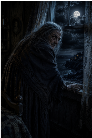
Old Hag Folklore

As fierce Atlantic storms battered the rocky shores of Newfoundland, families gathered around warm kitchen stoves and crackling fires to tell stories that blurred the line between dream and waking. Among the most chilling was the tale of the Old Hag, a mysterious spirit said to visit sleeping victims in the dead of night.