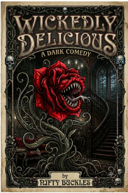
Wickedly De- licious

A delightfully dark Victorian comedy where chocolate, eccentric spirits, and one very unusual carnivorous rose make for a wickedly unforgettable tale.