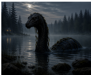
Cressie Cape Breton's Hidden Lake Monster

Long before tales of Scotland's Loch Ness Monster became world famous, people in Cape Breton, Nova Scotia, were whispering about another mysterious creature. Deep within the calm waters of Lake Ainslie, witnesses claimed to have seen a strange serpent-like animal gliding silently across the surface. They called the elusive creature Cressie.