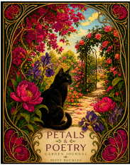
Petals & Poetry Garden Journal