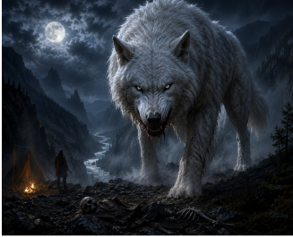
Giant White Wolf

wolves, whose sheer size may have inspired tales of a supernatural predator stalking the wilderness.