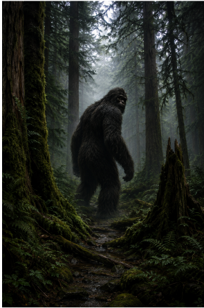
Sasquatch in B.C. Forests

"If the forest suddenly falls silent, some say you're no longer alone."