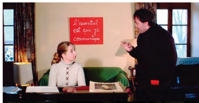
Working with Lise de la Salle when she was 13 years old