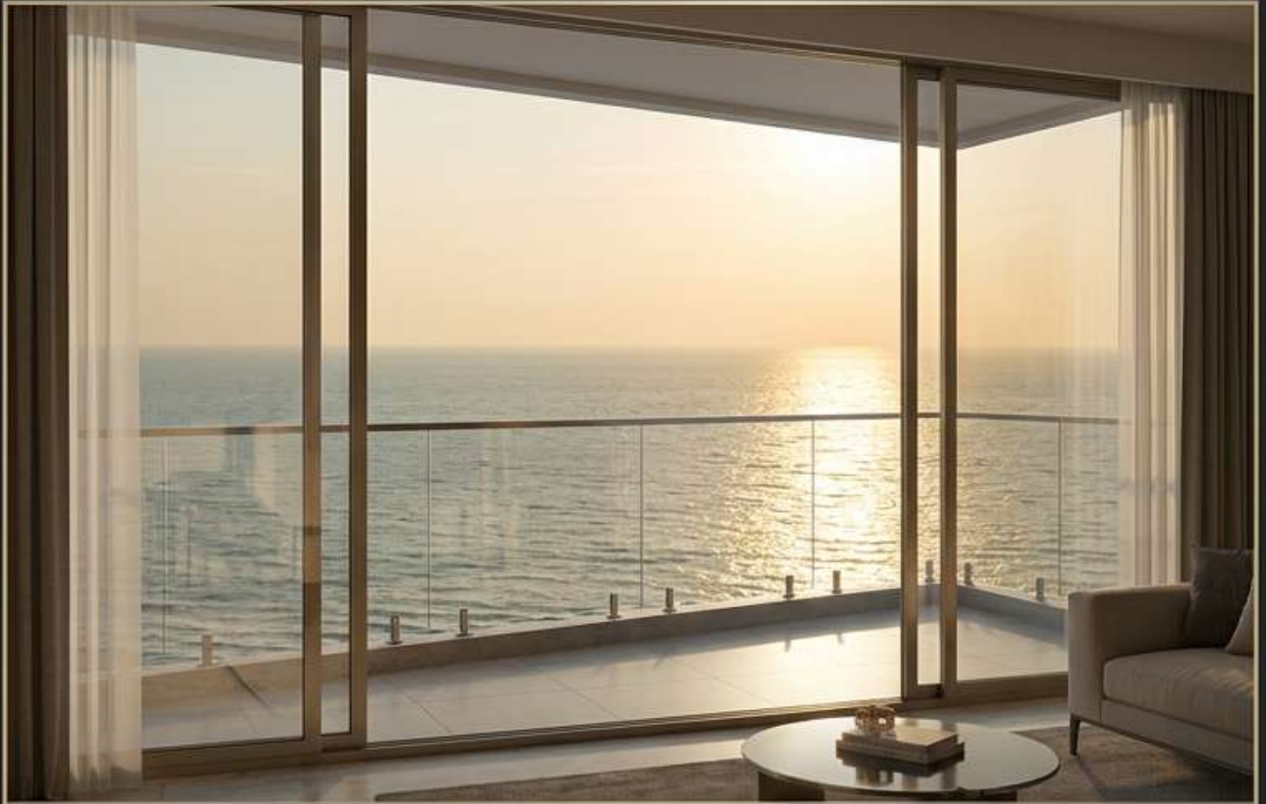
Endless Arabian Sea