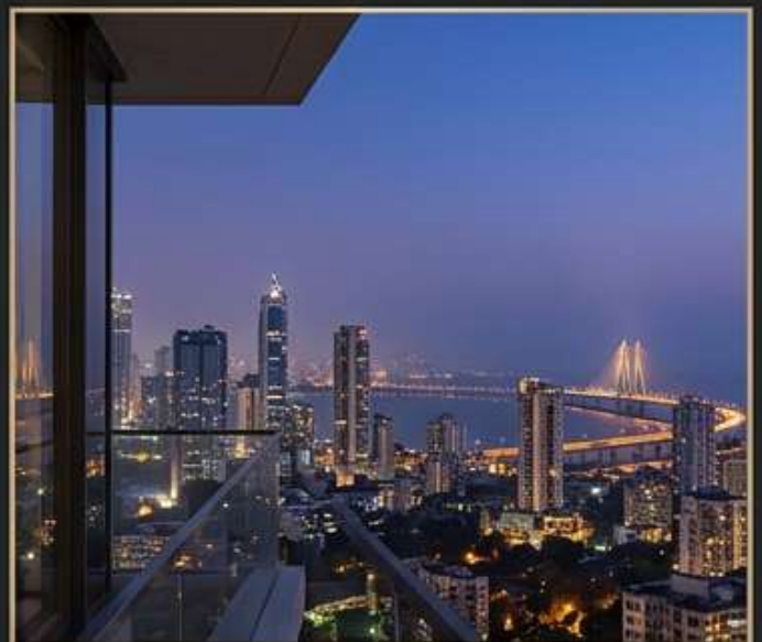
City & Sea Link Skyline