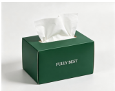
TABLE NAPKIN SERIES