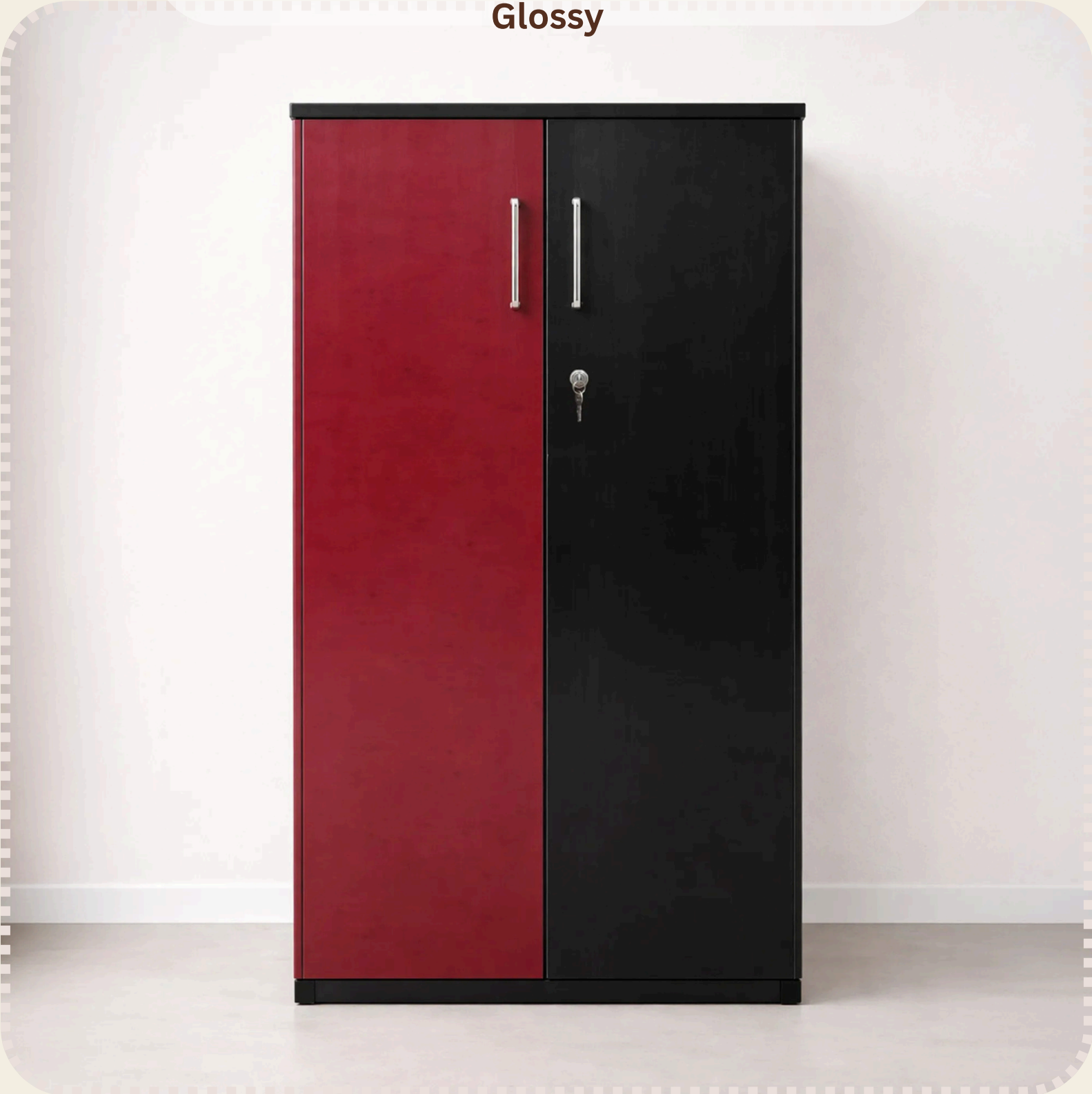
Multipurpose 2-Door Storage Cabinet with Secure Locks, Red & Black Pet G Glossy