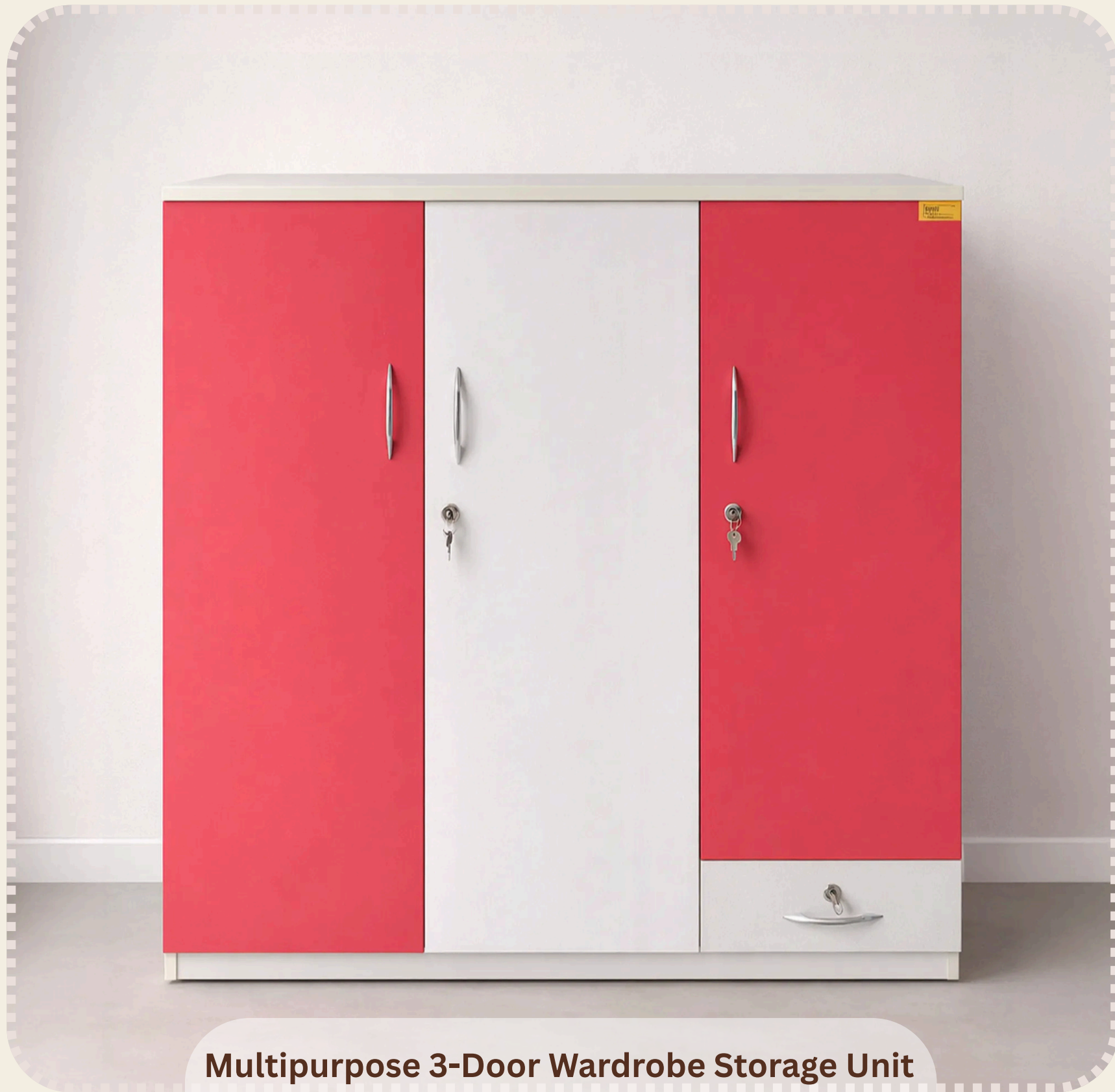
Multipurpose 3-Door Wardrobe Storage Unit with Secure Locks, Red & White