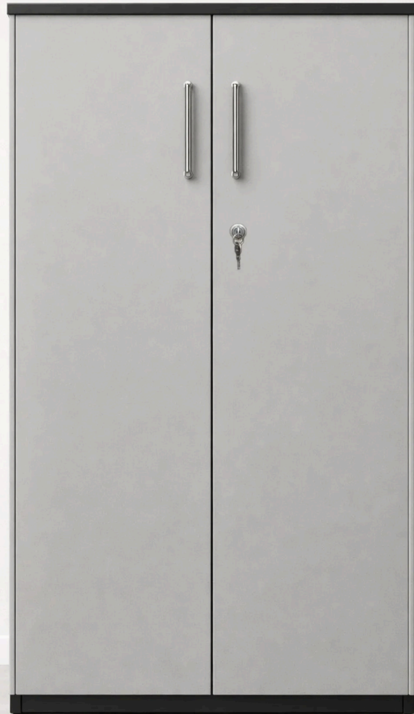
Multipurpose 2-Door Storage Cabinet with Secure Locks, Grey PET G