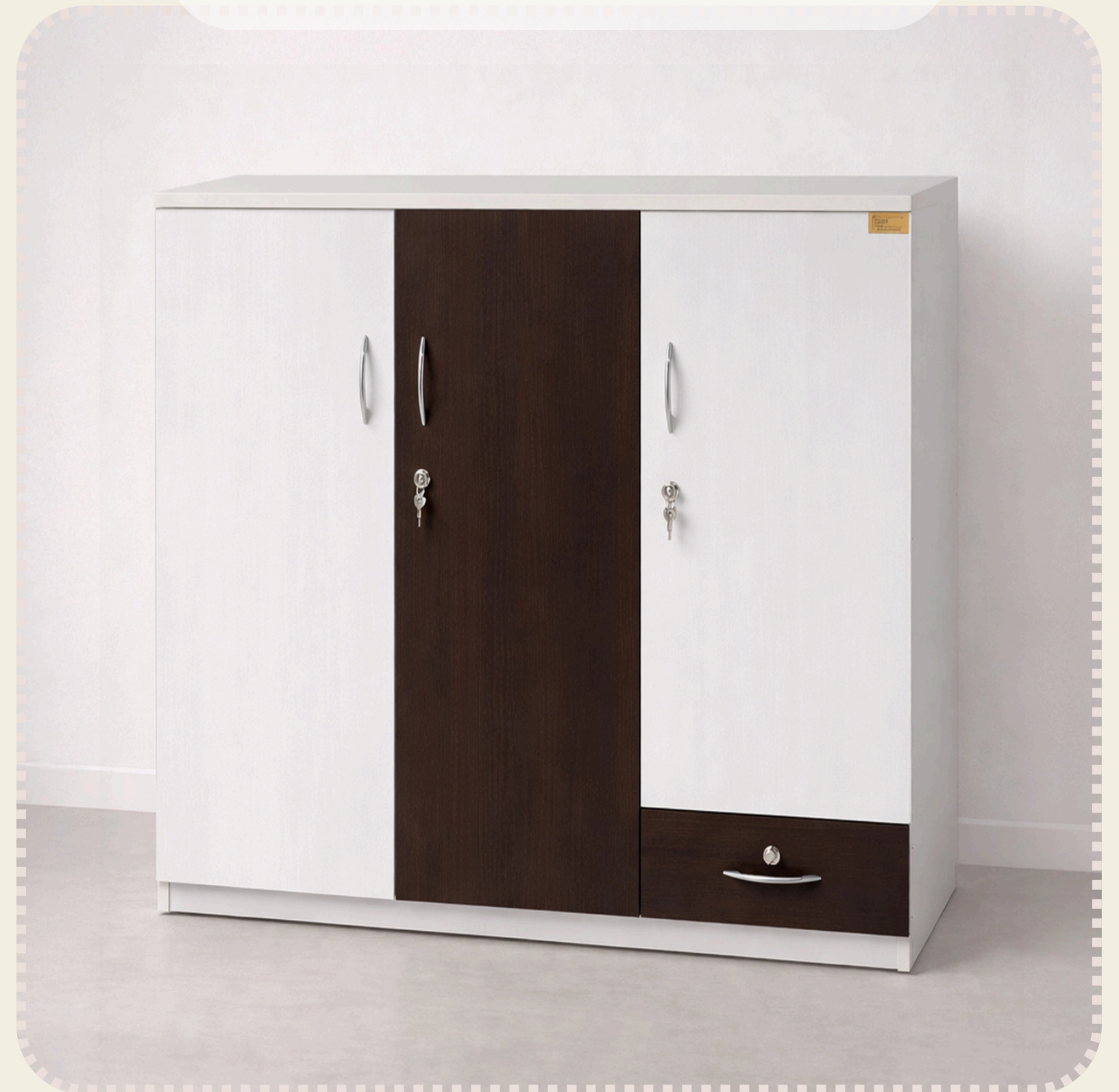
Multipurpose 3-Door Storage Unit with Secure Locks, White & Walnut Brown