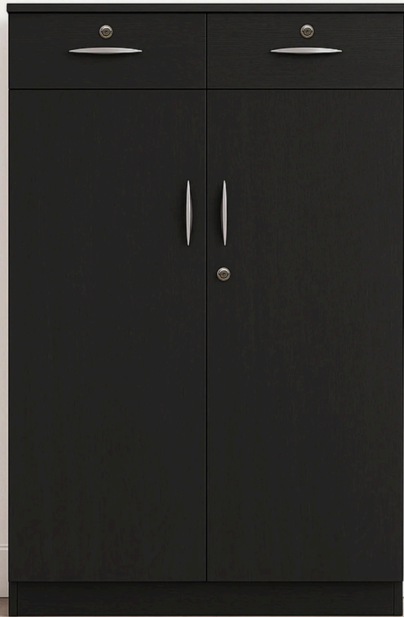
Modern Multipurpose Storage Cabinet with Dual Drawers, Matte Black