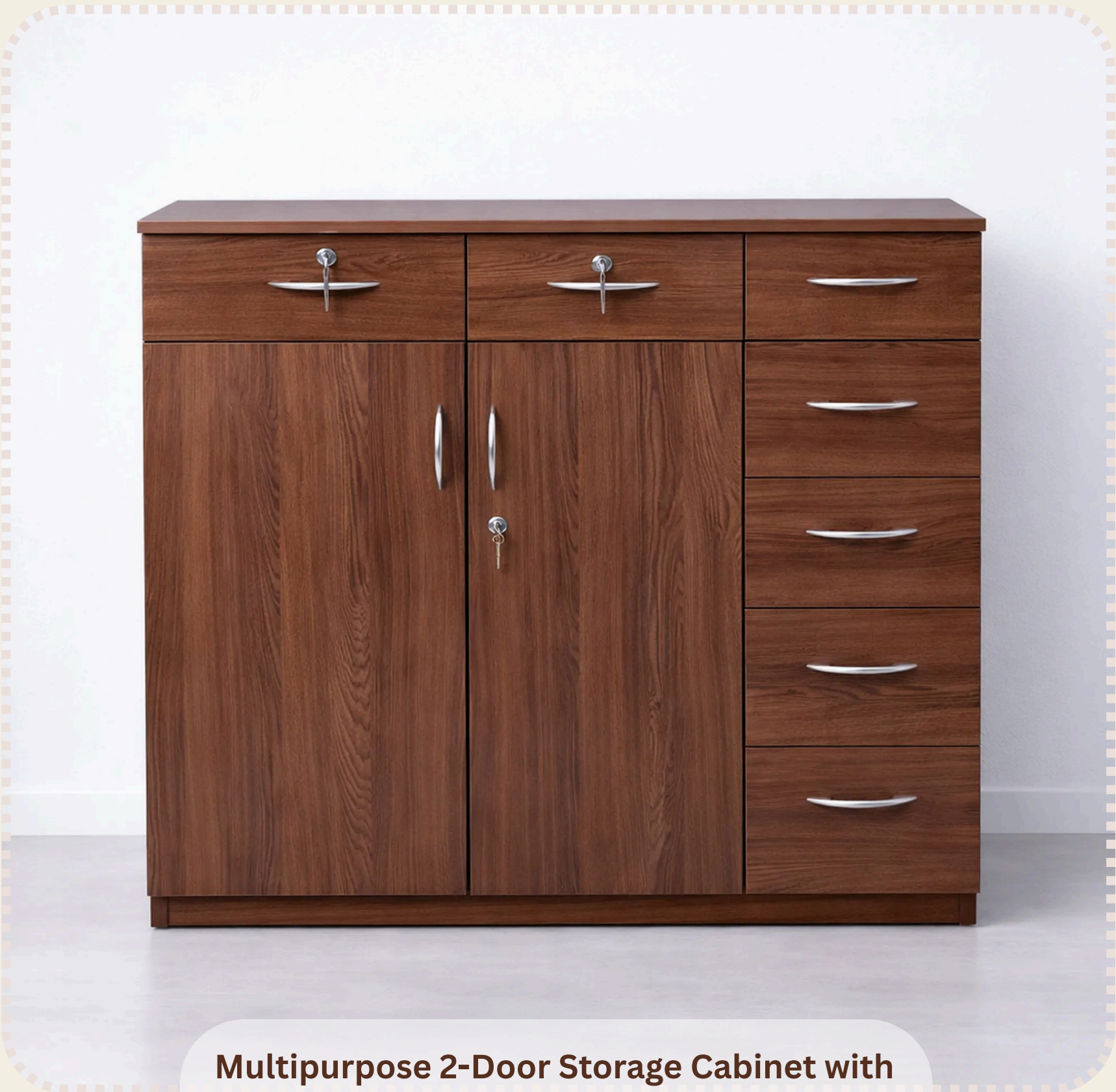
Multipurpose 2-Door Storage Cabinet with Secure Locks & Multi Drawers, Walnut Finish