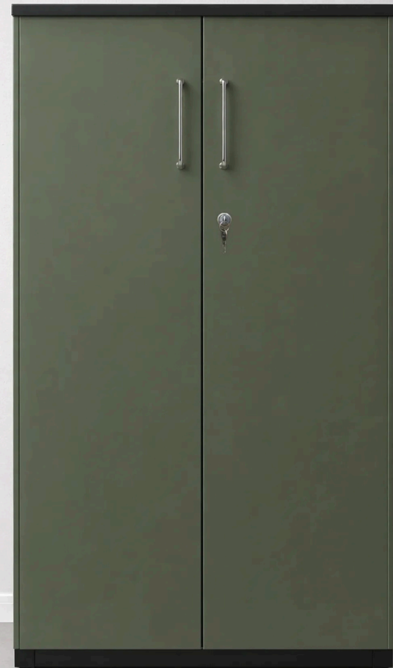
Multipurpose 2-Door Storage Cabinet with Secure Locks, Olive Green PET G