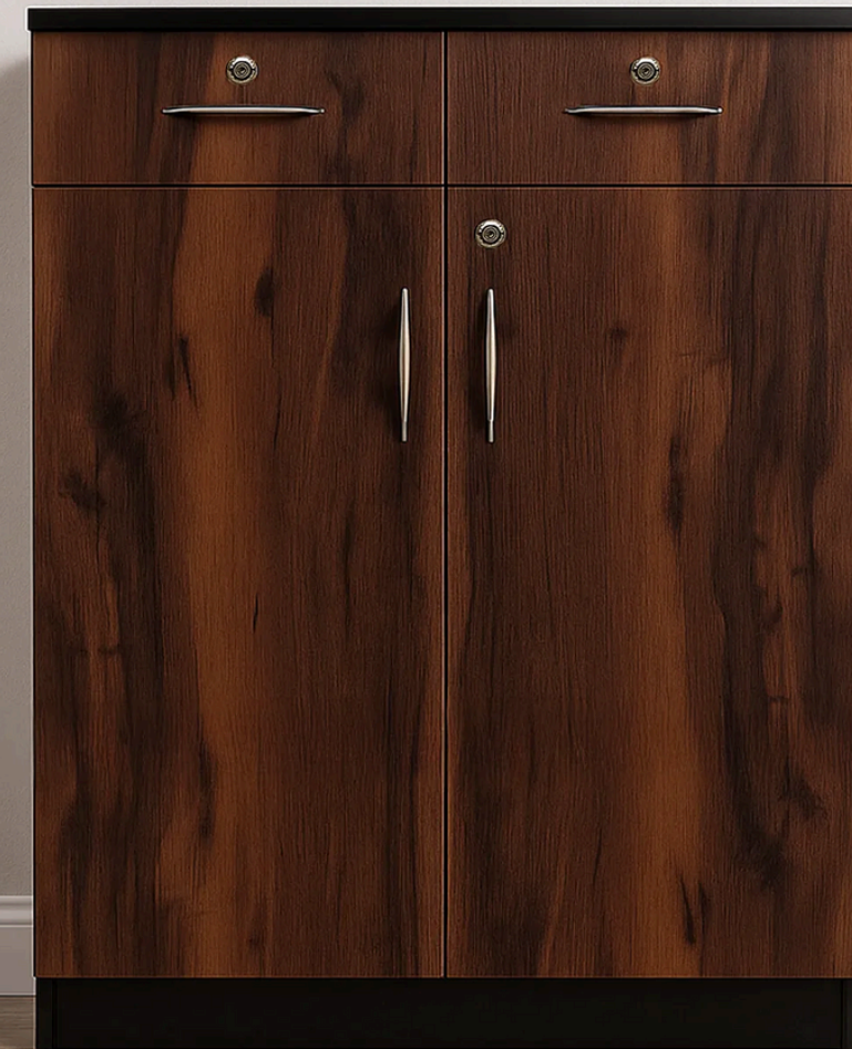
Modern Multipurpose Storage Cabinet with Dual Drawers, Classic Walnut