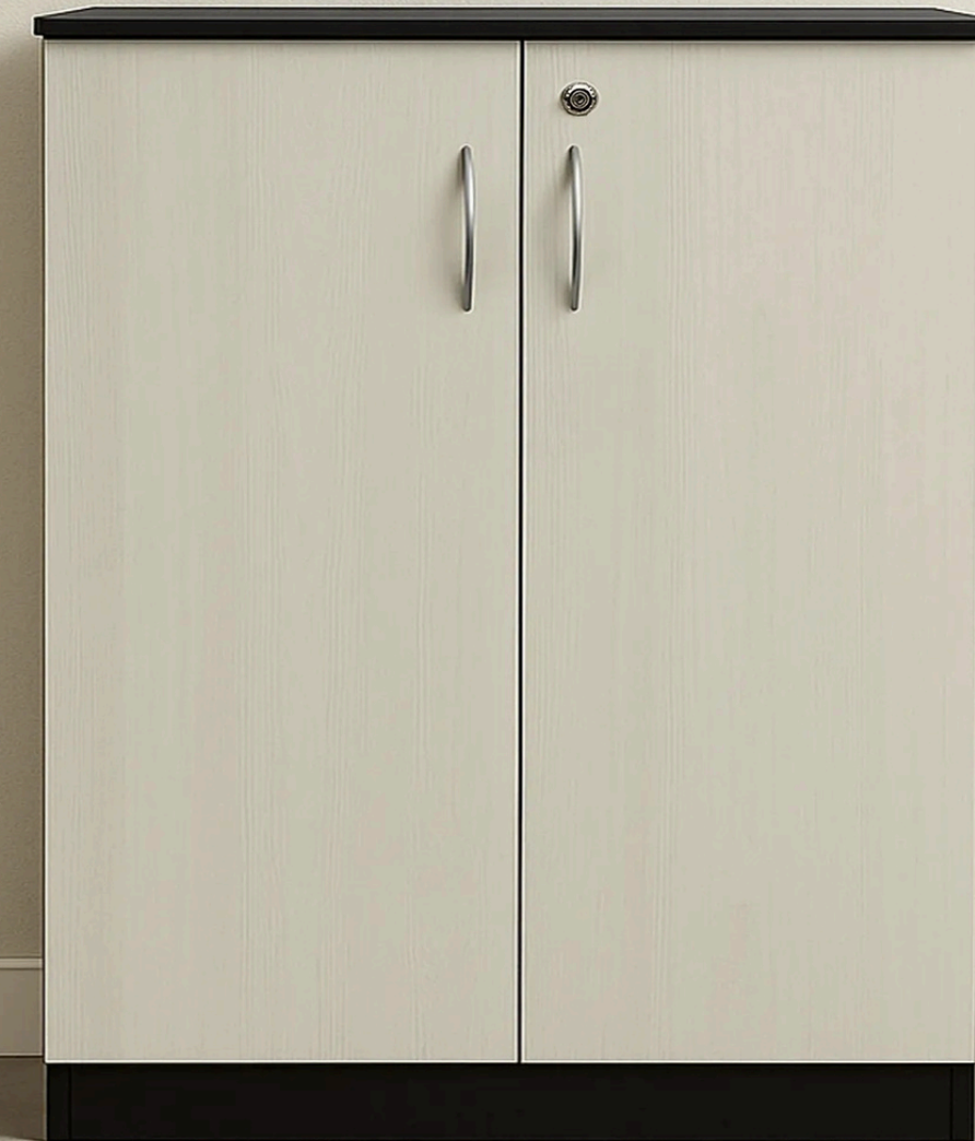
Modern Multipurpose Storage Cabinet with Double Doors, White Black