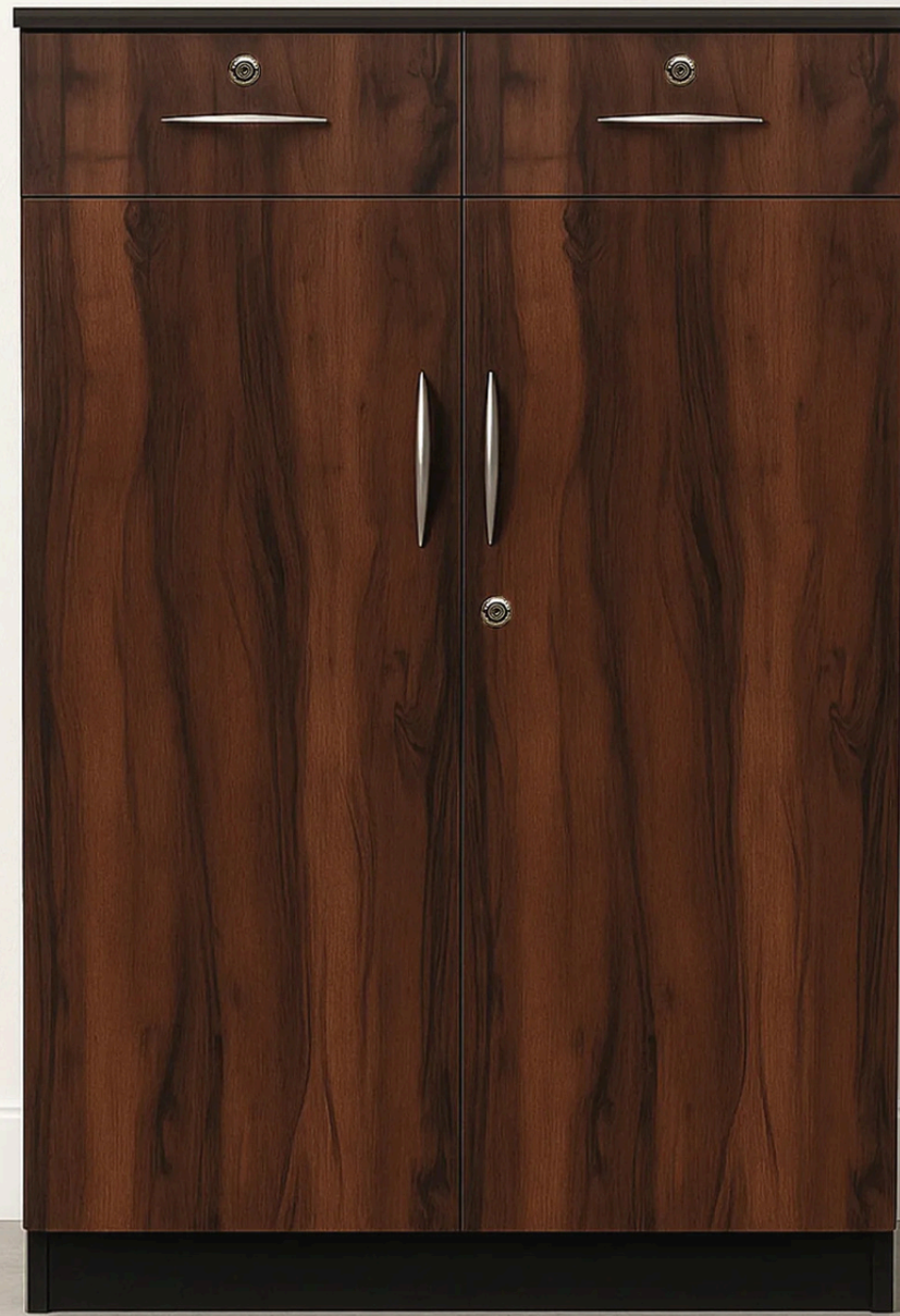
Modern Multipurpose Storage Cabinet with Dual Drawers, Dark Walnut