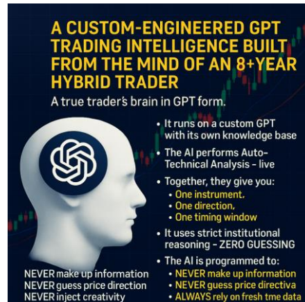
System architecture panel

Macro GPS does not merely summarize the market. It translates the market into a ranked execution opportunity.