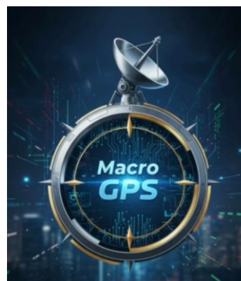
Brand asset: Macro GPS signal mark

A premium execution engine designed to look and feel like a professional macro desk tool.