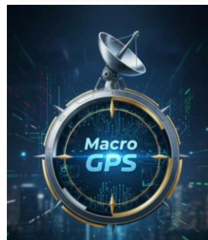
Brand and product marks