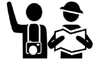
Special Interest Tours