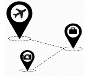
Excursions / Sight Seeing Tours