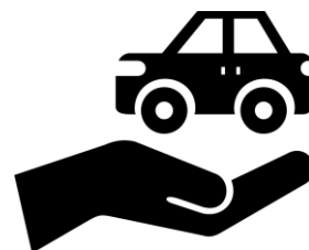
Airport Transfer / Car Hire / Private Chauffeur Drive