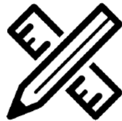
Tailor made packages