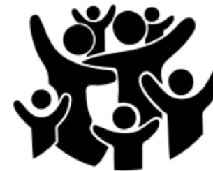
Family Reunions / Celebrations