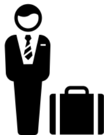
Corporate Travel Management