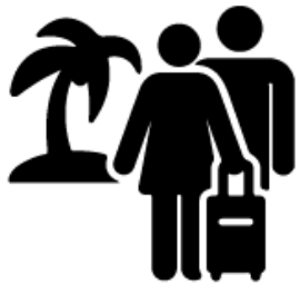
Free Independent Traveler (FIT)