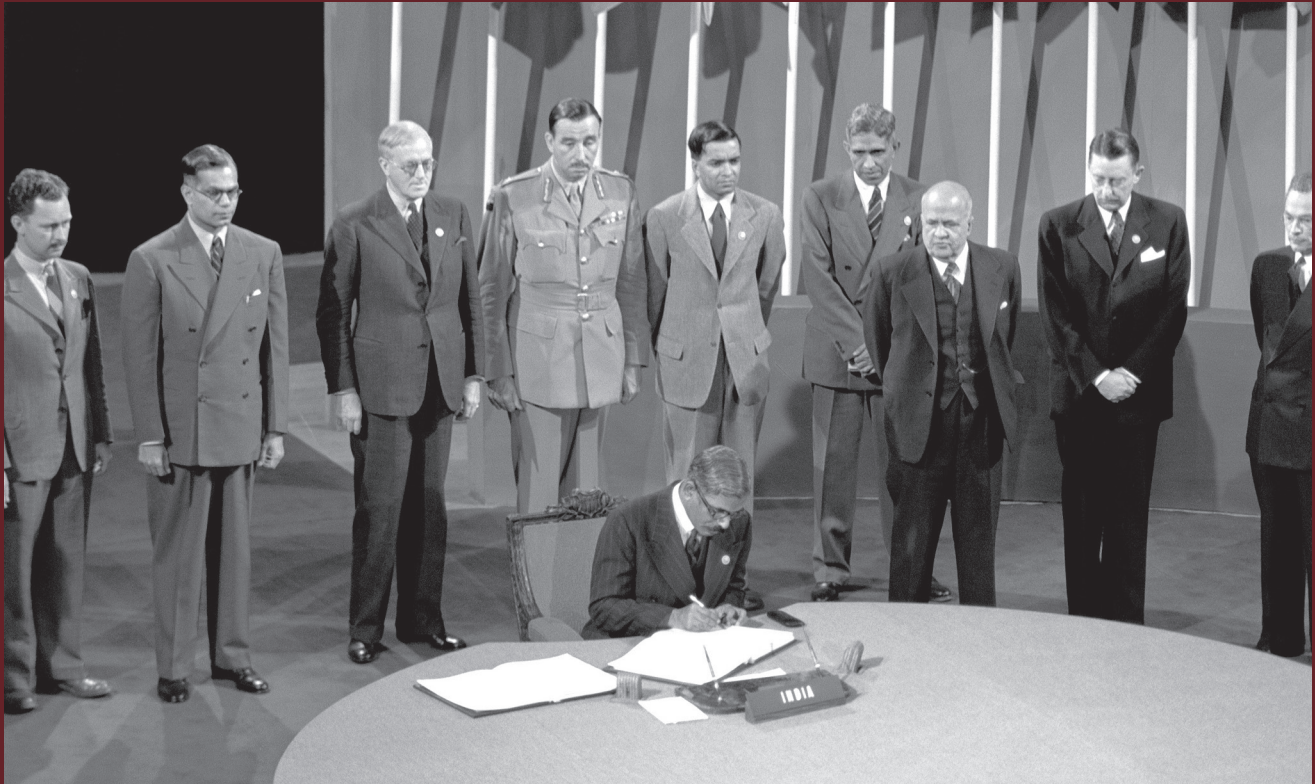
Sir Arcot Ramaswamy Mudaliar , leader of Indian delegation to San Francisco Conference Siging the UN Charter on 26th June 1945

FOR INDIA: POUR L'INDE: 印度: За Индию: POR LA INDIA: ARamaswami Mudaliar V. T. Krishnamo Chari