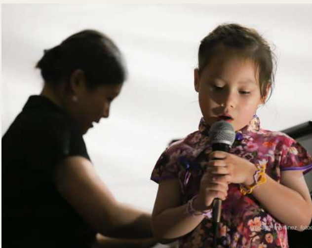
Children take the microphone as concert presenters

Masterclasses, workshops, youth performances and heritage activities make Yetas a classroom as much as a stage. Alongside musical training, initiatives such as Yeto's Tales introduce children to the stories, traditions and identity of the Sierra del Segura, connecting education with the cultural life of the territory.