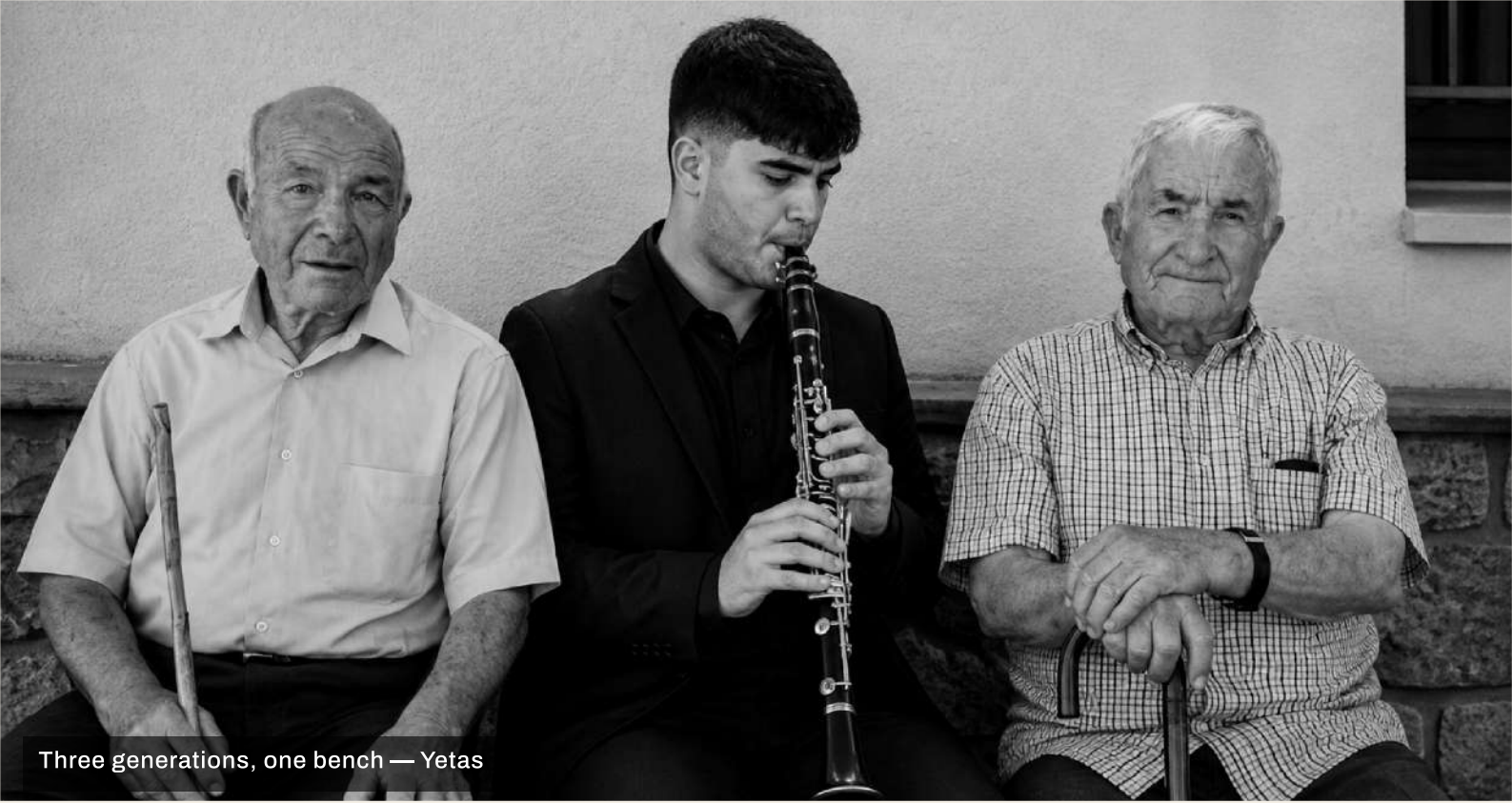
Three generations, one bench — Yetas