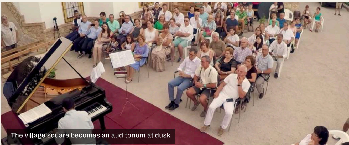
The village square becomes an auditorium at dusk