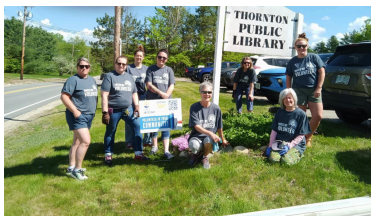
Volunteers helped us with our gardens and window cleaning in May as a project with the United Way Day of Caring.