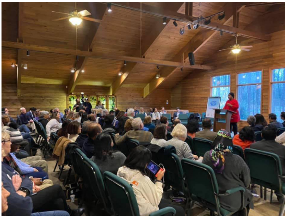
Stacey Abrams addressing the room.

Former Georgia Minority Leader and Founder and Chair of Fair Fight Stacey Abrams served as the keynote speaker. Leader Abrams talked about her 2018 campaign, the importance of building coalitions across communities, and getting out the vote. "We can change what happens in 2020," she said. "We can show up." Abrams also addressed the upcoming Census, and warned of a possible undercount in communities of color.